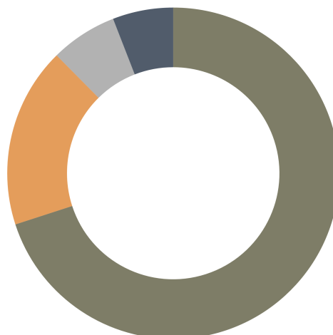
Portfolio Geographic Exposures